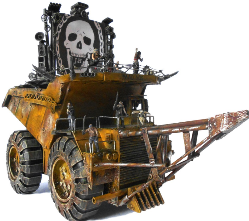
The Mad Dog by James Hall

When this vehicle makes a shooting attack with a Mortar, it may choose to roll 0 attack dice to instead make a 2D6 explosion attack against every vehicle within medium range of the target vehicle, including the target vehicle.